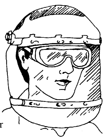
Wear a face shield over your safety glasses or goggles in high chemical exposure situations.