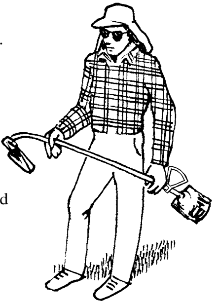
You can protect your eyes from the sun by wearing tinted safety glasses and a hat when working outdoors.